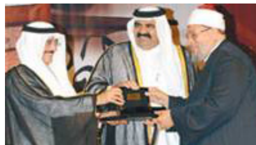
Sheikh Hamad bin Khalifa al-Thani handing over the Merit State Award to Islamic scholar Sheikh Yusuf al-Qaradawi. Also seen is the Minister of Culture, Arts and Heritage Dr Hamad bin Abdulaziz al-Kuwari

For example, in the supplication part of a sermon on November 1,