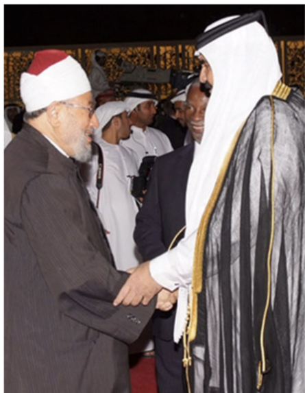
H.H. The Amir shakes hands with Sheikh Yusuf Al-Qaradawi at the commencement.