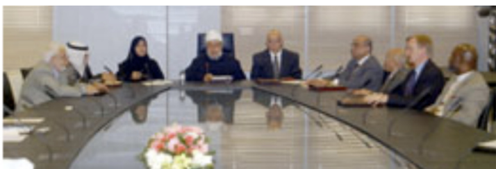
Sheikh Al-Qaradawi announcing the new Islamic Studies College as other members of the committee look on (Gulf Times, 04.15.07)

In the July/August 2008 edition of Foreign Policy magazine, readers voted for the Top 100 intellectuals worldwide. Number three on the list was Sheikh Yousef Al-Qaradawi: "The host of the popular Sharia and Life TV program on Al Jazeera, Qaradawi issues weekly fatwas on everything from whether Islam forbids all consumption of alcohol (no) to whether fighting U.S. troops in Iraq is a legitimate form of resistance (yes). Considered the spiritual leader of the Muslim Brotherhood, Qaradawi condemned the September 11 attacks, but his pronouncements since, like his justification of suicide attacks, ensure his divisive reputation." 36